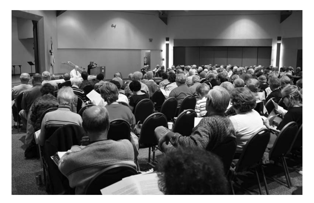
Almost 300 people attended MediScope, the Foundation sponsored program to help seniors, their spouses and children sort out the complicated new prescription drug benefit plan that became effective on January 1, 2006. Many are still trying to deal with this new plan.

For further information, call the Foundation office or visit the Foundation's web site. 216-421-5500 Phone · 216-421-5633 Fax · www.MtSinaiFoundation.org