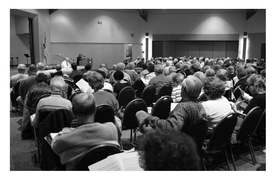
Almost 300 people attended MediScope, the Foundation sponsored program to help seniors, their spouses and children sort out the complicated new prescription drug benefit plan that became effective on January 1, 2006. Many are still trying to deal with this new plan.

For further information, call the Foundation office or visit the Foundation's web site. 216-421-5500 Phone · 216-421-5633 Fax · www.MtSinaiFoundation.org