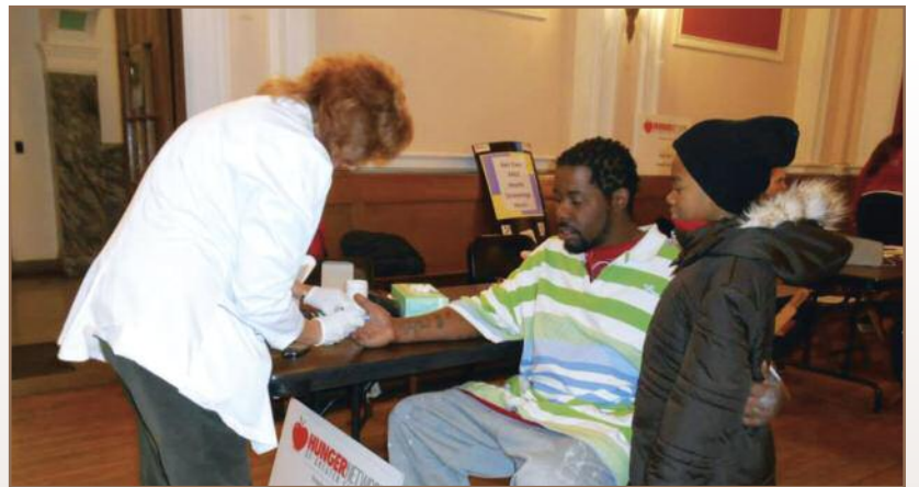
(Right) Medical staff provide screening and health promotion information at various Hunger Network locations.

The Mt. Sinai Health Care Foundation has funded a number of important programs, often in partnership with other foundations, government, and non-profits, to create a healthier Cleveland.