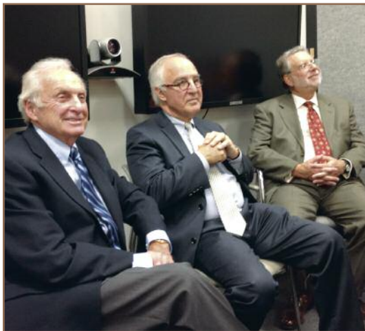
(Right) Foundation directors toured the Cleveland Clinic Medical Simulation Center.