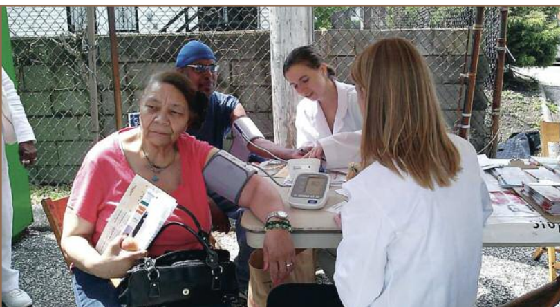
(Left) Residents get health screenings at Hunger Network sites as part of Stay Well Program .