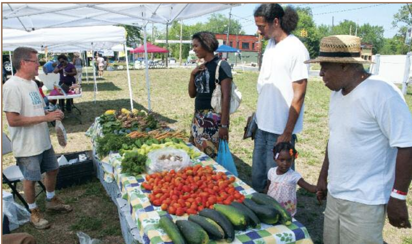
(Left) Local families use Produce Perks to purchase healthy fruits and vegetables at local farmers markets.

In addition to the many projects that the Foundation funds, Mt. Sinai staff serve on many local and statewide committees that focus on creating a healthy Cleveland and a healthy Ohio. Through participation in the creation of programs such as The Health Improvement Partnership – Cuyahoga County (HIP-C) and the Healthy Cleveland Initiative , Mt. Sinai is able to contribute to making Cleveland a healthier place for all of its residents.