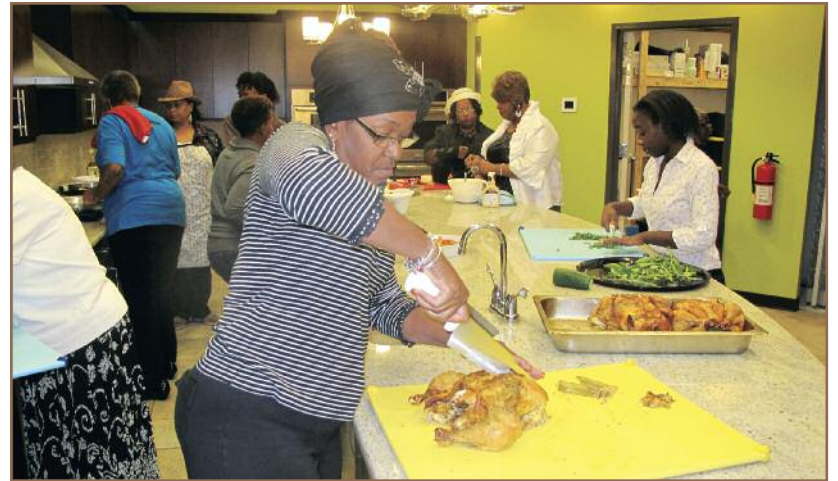
(Right) Neighbors from Kinsman/Union and Central learn healthy cooking and nutrition at Burten, Bell, Carr Development .