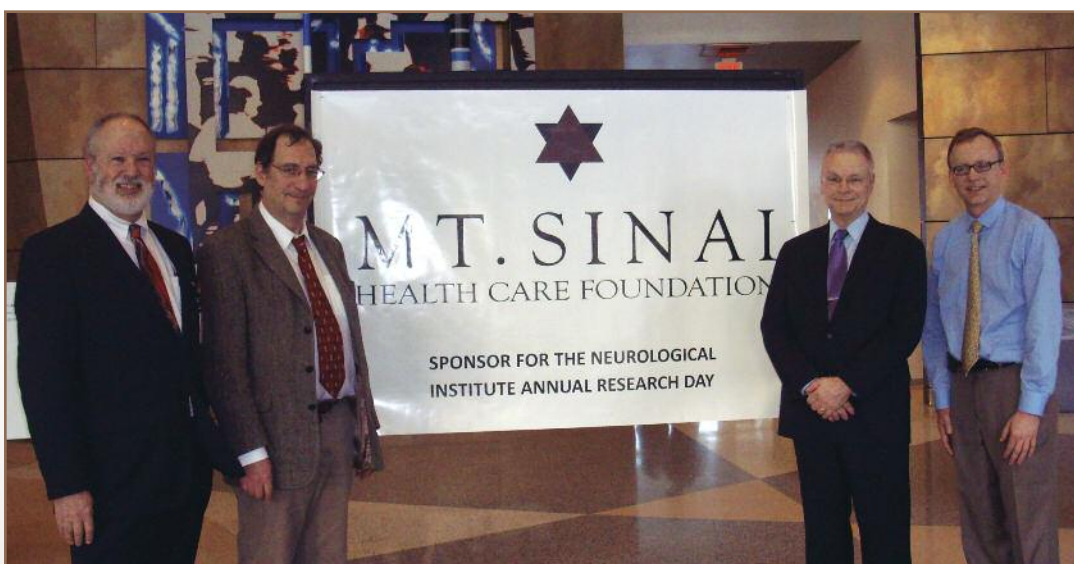
(Left) The Mt. Sinai Health Care Foundation was the sponsor for the Neurological Institute Fifth Annual Research Day held on April 15-16, 2014, at University Hospitals Neurological Institute.