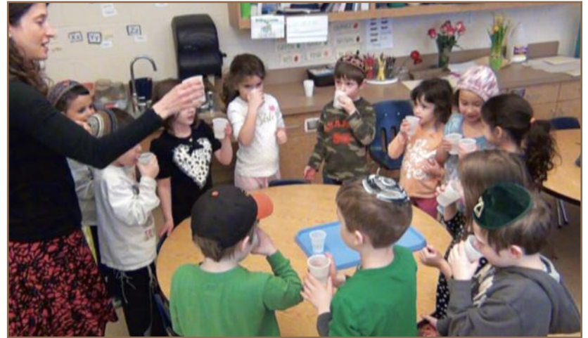
(Left) Children participating in a Jump To It session. (Right) Fuchs-Mizrachi School Jump To It pilot program teaching the importance of water.

• Jump To It , a school-based, early childhood obesity prevention/wellness promotion program with an innovative curriculum, promotes a healthy lifestyle for pre-K and kindergarten children and their families. The evidence-based program emphasizes healthy, nutritious eating, increased physical activity, limited screen time, adequate sleep and the elimination of sugary beverages. The program was developed through collaboration among the Foundation, UH/Rainbow Babies and Children's Hospital, The Children's Museum of Cleveland and the Cleveland Metropolitan School District (CMSD).