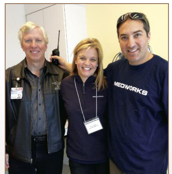
(Right) Foundation Grantee MedWorks offered a women's health clinic on May 3, 2014, at the Stephanie Tubbs Jones Health Center in East Cleveland. On hand were a corps of medical volunteers that offered pelvic ultrasounds, pap smears and mammograms, as well as general medical services in medical specialties including cardiology, urology, dermatology, ear, nose and throat, rheumatology, and podiatry.