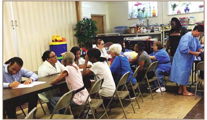
(Left) Members of the Stay Well team | (Right) Stay Well Program health education underway