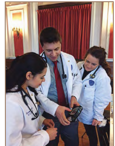
(Right) Students from Case Western Reserve University participating in the Hunger Network's Stay Well Program