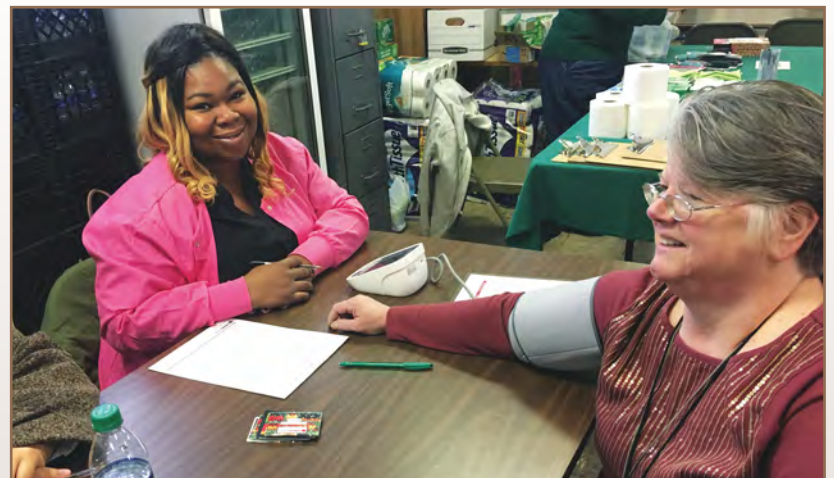
Hunger Network Stay Well clinical screenings underway