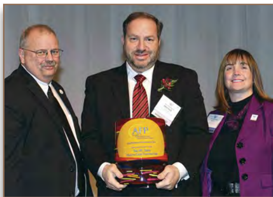
(left) The Mt. Sinai Health Care Foundation received the 2014 Foundation Leadership Award from the Association of Fundraising Professionals as part of National Philanthropy Day.