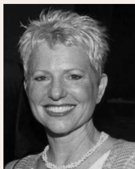
Renee Chelm Jewish Community