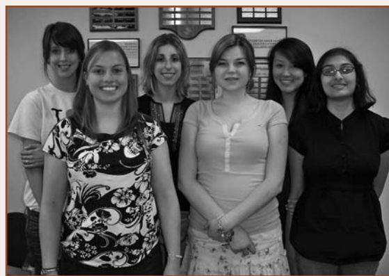
The interns who participated in the Mt. Sinai Diabetes Research Program.

The second summer internship funded by the Foundation was the Cleveland Hillel Foundation summer internship program. The purpose of the Hillel-sponsored program is to place Jewish college students in internships